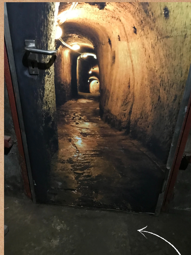
Hidden art bunker tunnel under medieval Nuremberg