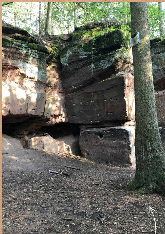
Forest and sandstone above Nuremberg