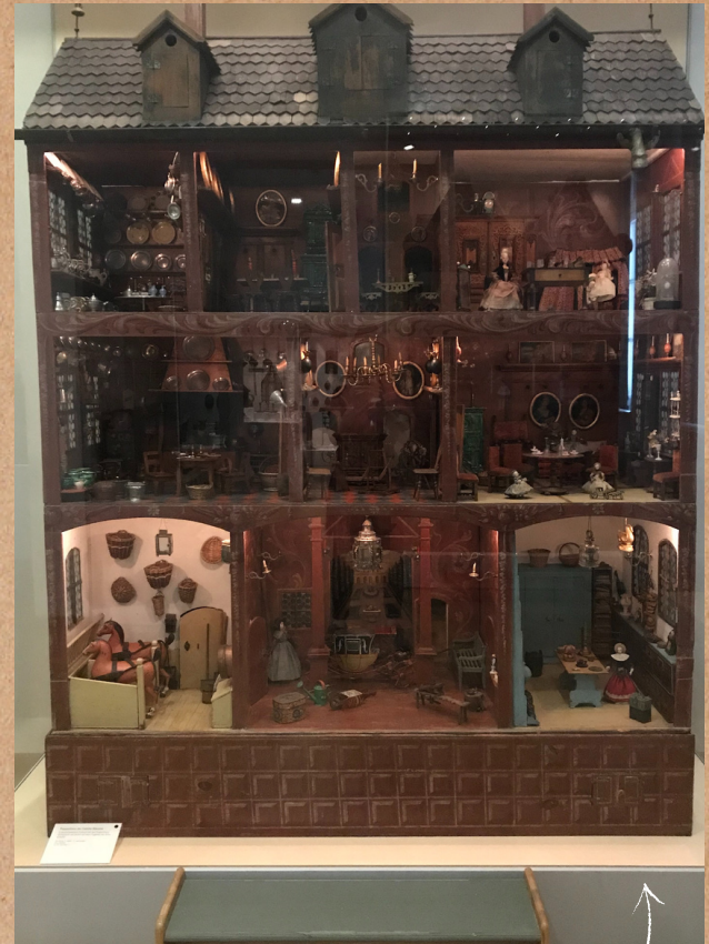
Dollhouse in Nuremberg toy museum